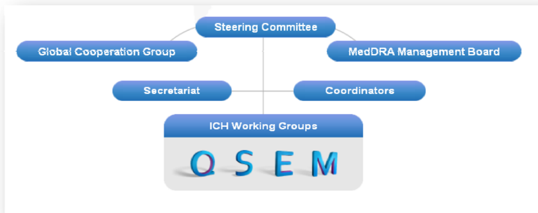
Figure 1: ICH structure

The ICH structure consists of the ICH Steering Committee, ICH Coordinators, ICH Secretariat and ICH Working Groups. The ICH Global Cooperation Group (GCG) and the ICH MedDRA Management Board are sub-committees of the ICH Steering Committee (Figure 1).